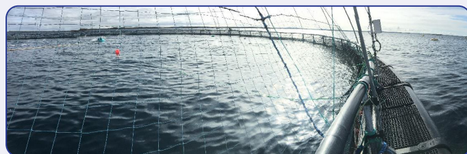
Image: SICA deployed in one of the cages and SINTEF ACE Control Centre (at the back).

The Smart System for Feeding Control (SICA) was developed by the Marine Technology Centre (CTN). SICA is a non-invasive,