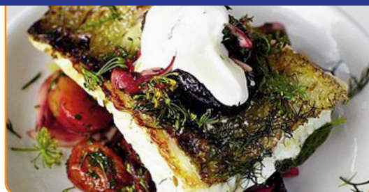
© David Loftus / Jamie Oliver's Food Escapes: Over 100 Recipes from the Great Food Regions of the World