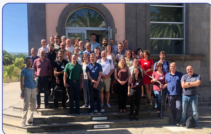
AQUAEXCEL 2020 consortium partners at the last in-person meeting in Las Palmas, Gran Canaria

The project will deliver expanded access to high-quality services and resources, covering all scientific fields relevant to research and innovation in aquaculture, from genetics to technology through immunology, physiology and nutrition, and include new nanosensors and fish isogenic lines developed in the previous projects.